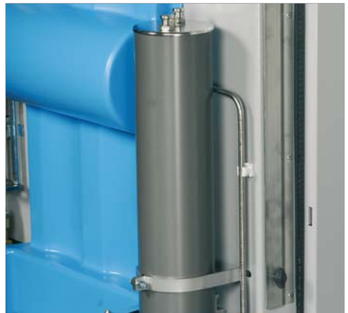
P41 filter system, cartridge change in a minute