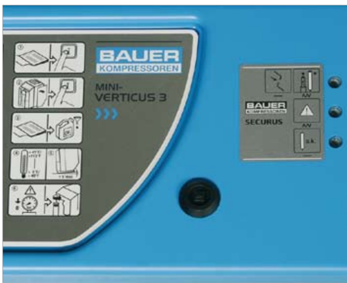
SECURUS - perfectly integrated design