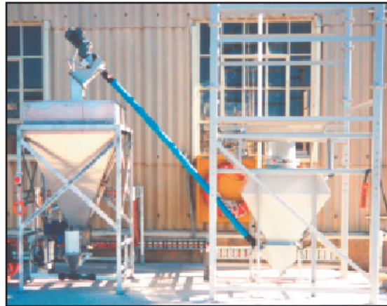
PAC system under assembly showing intermediate hopper, day hopper and transfer screw

ProMinent packaged plants are purpose designed and manufactured in Australia to meet the needs and flexibility of our clients. By combining the overseas and local knowledge to be found at ProMinent , we can offer the support and engineering input to meet your needs.