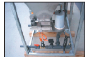
The eductor wetting system is used on powders like PAC and polyelectrolyte. The specially designed wetting chamber is more suitable for medium pressure discharges and feeds directly into our Spectra progressive cavity pump

Incorporated into these plants are the ProMinent range of metering pumps or Spectra® helical rotor pumps for the more difficult metering duties such as Polymer and PAC. Spectra® pumps are also available for sludge and other sewage applications.